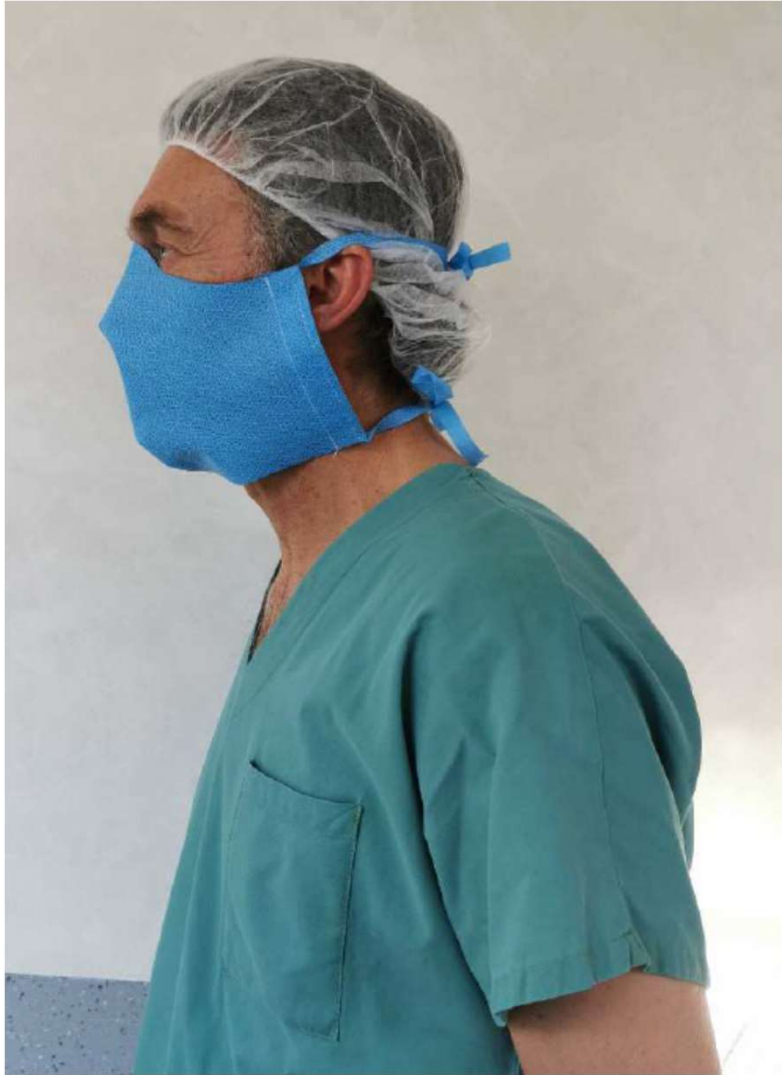
Mask produced by conventional sewing machines