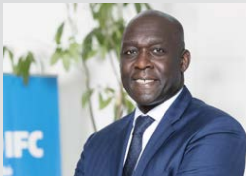
Makhtar Diop IFC Managing Director

Our leadership shapes IFC's strategies and policies and oversees the effective deployment of our resources, with a focus on maximizing development impact and meeting the needs of our clients. IFC's Management Team brings together years of development experience, a broad array of expertise, and complementary cultural perspectives.