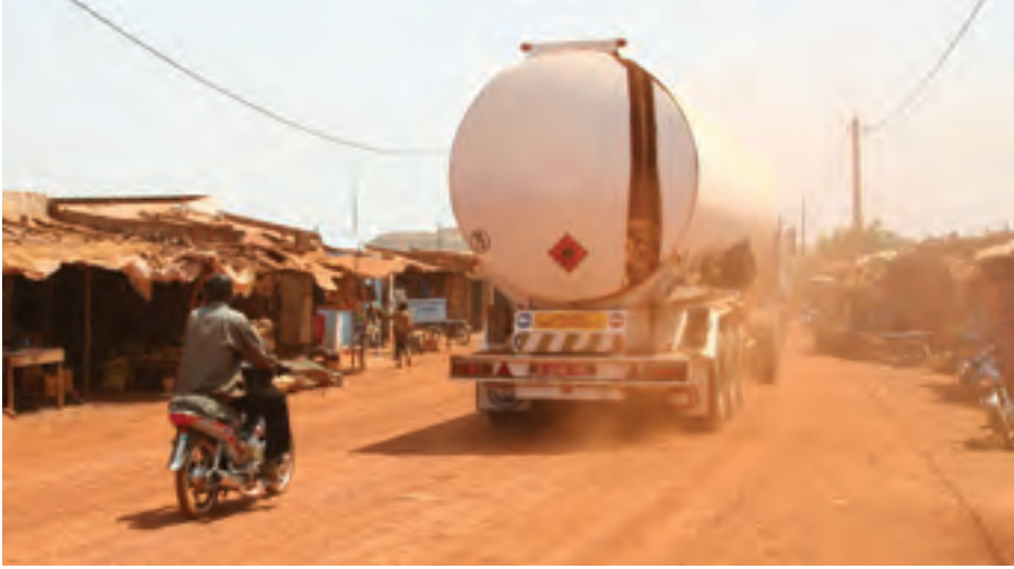
Image 17. The Sadiola Gold Mine is located in a remote area in north-west Mali. The Project relies heavily on vehicular transport to supply the operations. One consequence of a regular trucking schedule reliant on an established access route, has been the proliferation of road-side shops, the majority of which have been established by and are operated by migrants. Besides obvious health and safety issues with unplanned roadside development, the migrant capture of such small business opportunities represents a missed opportunity for local people.