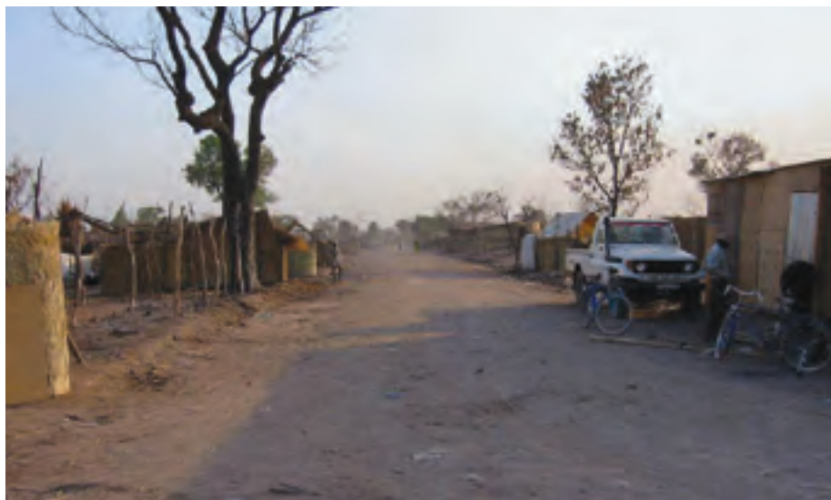
Image 22. A new street in Komé Atan settlement, Chad, near the Chad-Cameroon Oil Pipeline Project. After the 2002 and 2003 fires, the local government and the Oil Consortium worked together to develop an organized village layout with wider streets.