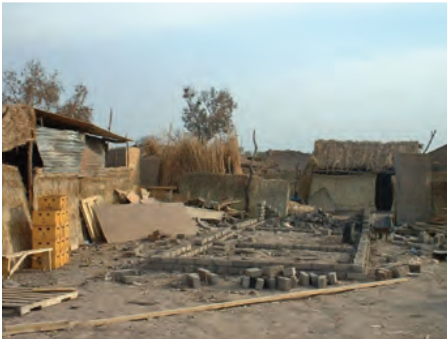
Image 21. Komé Atan settlement, Chad near Chad Cameroon Oil Pipeline Project. After the 2002 and 2003, fires an increasing number of houses were built using permanent materials allowing Komé Atan to evolve from an informal, albeit long-established settlement into a new village recognized by local government.