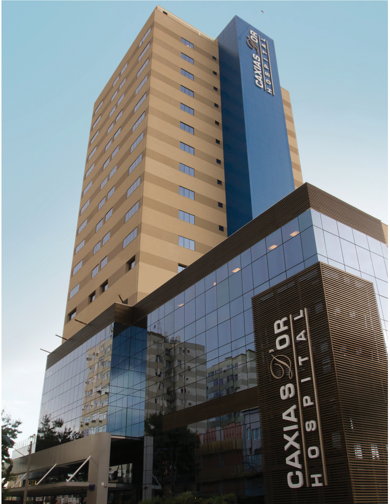
IFC shared information and acted as a sounding board to exchange and brainstorm ideas.