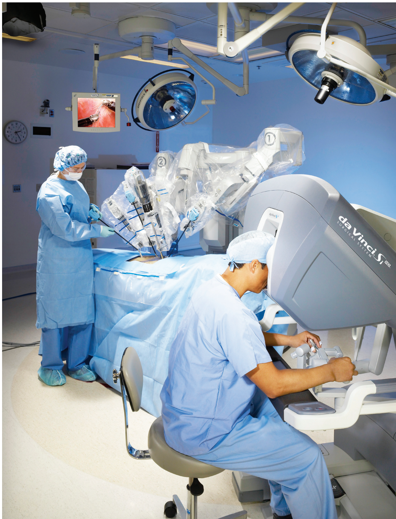
The demand for sophisticated hospital services, using advanced technology such as robotics, continues to grow.