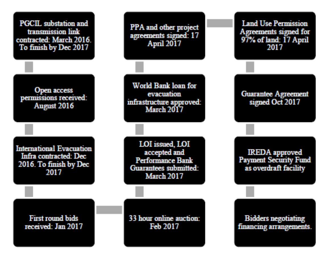
Figure 1: Project Preparation Process