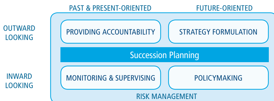
Figure 1. Board Responsibilities 2

Corporate governance drives risk management, and risk management anchors corporate governance. Corporate governance is a board responsibility because it is the board of director's role to direct and to ensure that controls are in place, with the objective of increasing shareholder value. To increase shareholder value requires the board to formulate strategy and business decisions. Strategy and business decisions carry risk; and risk and reward thus go together. Risk management is therefore an integral part of the board's corporate governance function and thus is a board responsibility. Figure 1 describes the board's corporate governance functions, and risk management is embedded in the other functions.