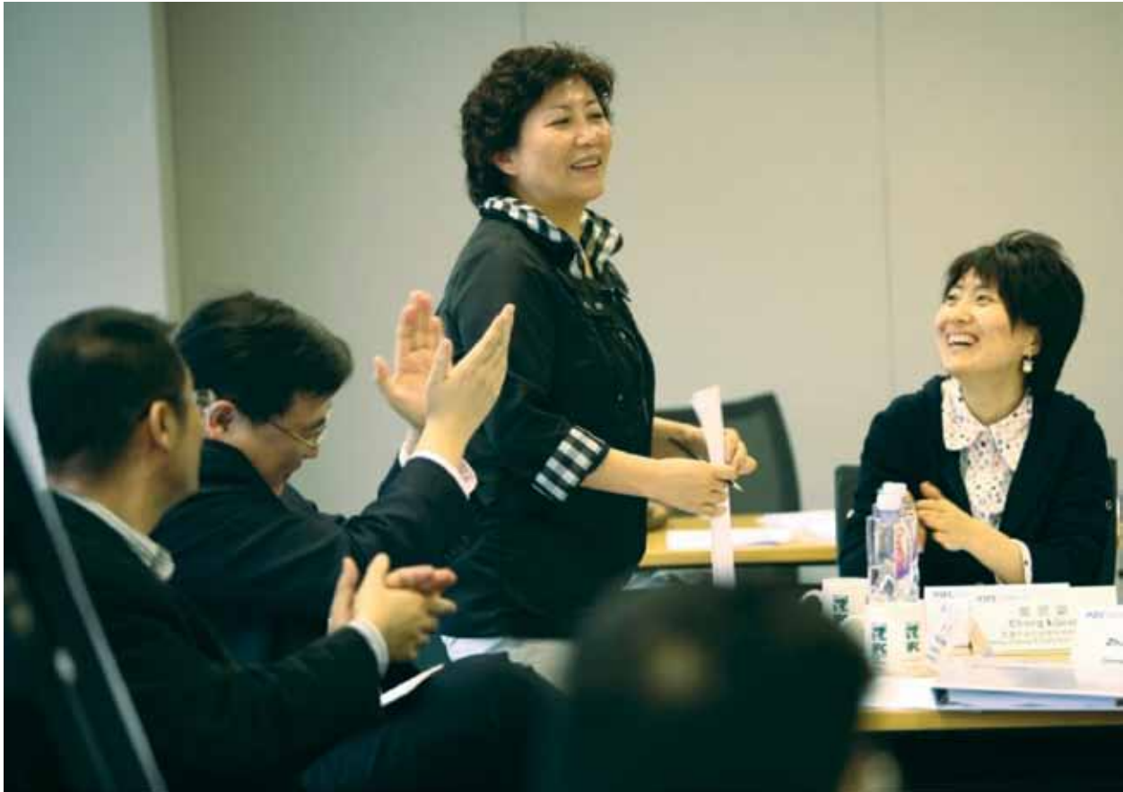
A training participant in the Beijing workshop presents the group discussion results.

among the candidate participants in each city, which helped select the best candidates. It also helped us understand their skills, experiences, and expectations for the training.