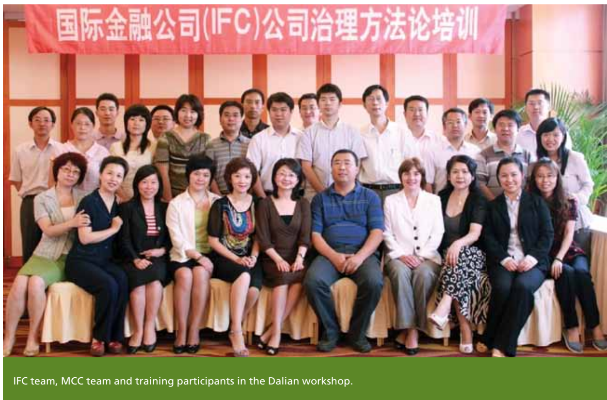
IFC team, MCC team and training participants in the Dalian workshop.

The objective of the 10 Cities Project is to build and strengthen the capacity of professional institutions for CG consulting services and to improve the CG