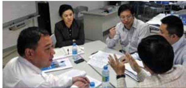
Training participants discuss the case studies in the Shenzhen workshop.

However, convincing this powerful institution to embark on a long journey with a “stranger” was not easy. In the beginning, MCC didn’t know about IFC and had doubts about our motives in China. To dispel their doubts, we invited MCC’s officers to IFC’s Beijing office for a field visit and showed them what IFC has done in China in the past years. We also invited MCC’s director to participate in the board of directors training workshop organized by the program. Gradually, MCC recognized the value