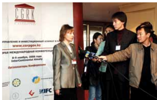
The conferences boosted the level of corporate governance in the local market and raised awareness of the topic through media mentions about its importance.

The project organized other seminars for journalists, who in turn became effective at promoting corporate governance through mass media in Kazakhstan. Not all participants of our seminars became fans of the topic. However, with some of them, IFC acquired long-term, fruitful relationships. Since 2006, for instance, Kazinform has published more than 30 news stories, articles, and interviews about IFC and corporate governance.