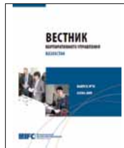
Vestnik of Corporate Governance .

The project worked closely with such partners as Standard & Poors, KPMG, international experts, and local bankers by publishing articles, interviews, and theoretical materials in our quarterly magazine, Vestnik of Corporate Governance .