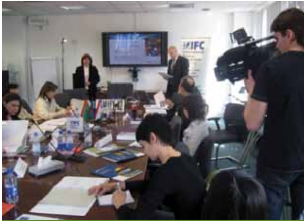
Twenty-four mass-media representatives participated in the writing seminar and evaluated it highly.

“The seminar for journalists organized by IFC was interesting due to the fact that it raises awareness of corporate governance. The topics were selected appropriately, the speakers were brilliant, and the presentations were informative, interesting, and intelligible. I personally learned important and interesting facts.”