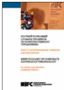
“Brief Glossary of Corporate Governance Terminology.”

As a result of educating journalists, the number of media mentions has increased. However, most news agencies use their in-house translators, who are not familiar with corporate governance terms. We found that the following items helped improve the journalists’ accuracy: