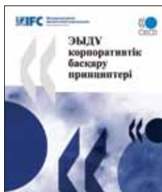
A Kazakh translation of OECD Principles.

• OECD Principles in Kazakh: IFC partnered with OECD to publish the official translation of the OECD Principles in Kazakh to educate policy-makers, investors, corporations, journalists, and other stakeholders in Kazakhstan. That was the first