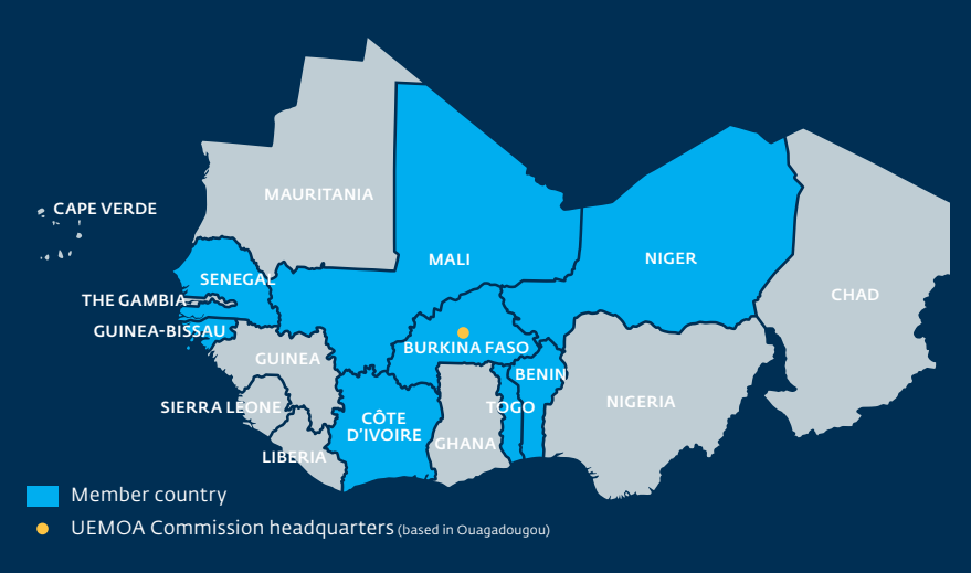
FIGURE 5 Member Countries of the West African Economic and Monetary Union

In 2017, through a 12-year local currency bond issue totaling CFA francs (CFAF) 25 billion ($45 million), CRRH was able to lengthen the term of its loans to financial institutions, which in turn enabled these institutions to lengthen the maturity of mortgages and significantly improve affordability. IFC utilized a new local currency facility at the World Bank that enables it to hedge foreign exchange risk in CFAF to participate with CFAF 5 billion ($9 million). The success of the local currency bond issue by CRRH is especially important, as international sources of finance would otherwise include foreign exchange risk.