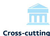
TABLE ES.1 PRIORITY RECOMMENDATIONS TO SUPPORT PRIVATE SECTOR DEVELOPMENT