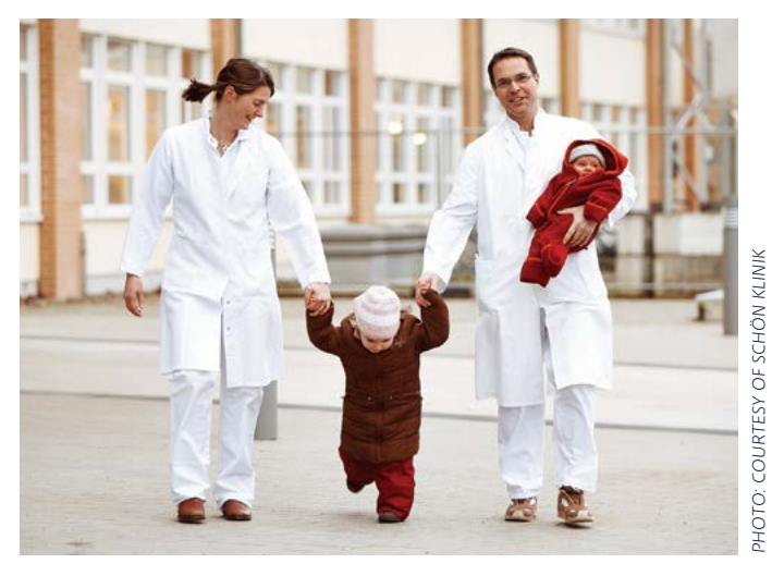
SCHÖN KLINIK NEUSTADT STAFF WITH THEIR CHILDREN

Investment in early and preschool education was substantially expanded, and, from 2013 onward, all children age one and older have been entitled to at least four hours of publicly provided childcare per day (European Commission, 2015). Although elementary schools still typically operate for only half of the workday, 60 percent of secondary schools now offer full-day options (European Commission, 2015). Yet, demand for childcare still substantially exceeds supply, particularly for children ages one to three, and for noncore times (early in the morning, later afternoon, and evenings). The demand for childcare for older children is better met (BMFSFJ, 2017). Only about half of all childcare provision for preschool children is full time (largely corresponding to parents' wishes), and only 17 percent of elementary school children are in all-day care (BMFSJ, 2017).