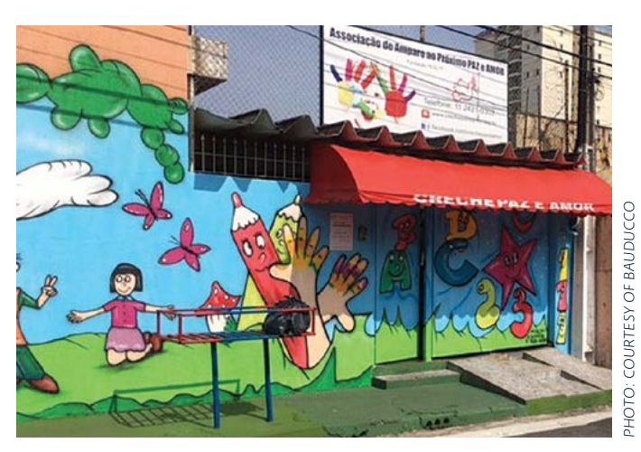
THE AMOR Y PAZ PRESCHOOL AND DAYCARE CENTER HAS PROVIDED CHILDCARE FOR PANDURATA ALIMENTOS LTDA. (BAUDUCCO) EMPLOYEES SINCE 1989.

Canuto, 2013). Women perform the large majority of unpaid house and care work. In Brazil's 2014 time use survey, slightly under half of men reported that they do not do any housework, compared to just 14 percent of women (Cobo, 2014). A 2007 study found that among those who did spend time on housework, childcare, or other care activities, women on average spent 27 hours per week compared to 12 hours for men, with greater differences for married couples (Bruschini, 2007).