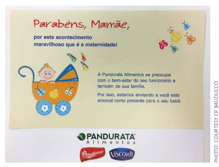
WELCOME PACK FOR NEW MOTHERS AT PANDURATA ALIMENTOS LTDA. (BAUDUCCO).

As part of its focus on supporting families, Pandurata Alimentos Ltda. (Bauducco) makes sure that pregnant women and new parents have access to all the information that will help them and their children to stay healthy. Pandurata Alimentos Ltda. (Bauducco) selected its healthcare insurance provider in part because it offers the services of a health advisor who comes monthly to discuss issues of relevance to the health of (soon to be) mothers and babies. When the baby is born, all new mothers at Pandurata Alimentos Ltda. (Bauducco) receive a welcome pack from the company with basic supplies and a calendar of vaccinations and suggested doctor visits to keep mother and baby healthy.