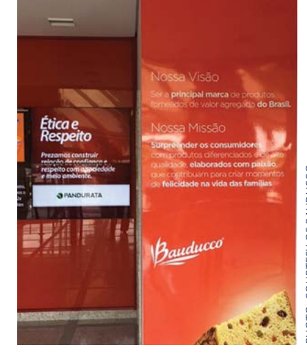
THE COMPANY'S MISSION AND VISION.