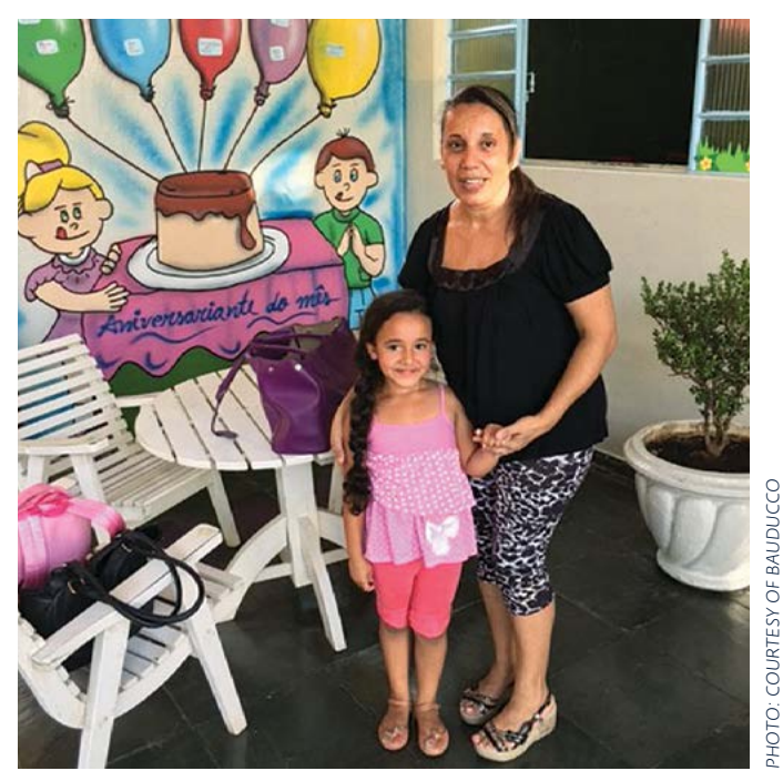
CHILDCARE SUPPORT PROVIDED BY PANDURATA ALIMENTOS LTDA. (BAUDUCCO).

In September 2016, 12 children of employees were enrolled in the center, which has a capacity of 100. This represents 28 percent of the women and children who in principle are eligible to use the benefit. The highest level of enrollment at any point in time was 20 children of employees. To date, parents have always been able to get a space for their children if they request one. Several women interviewed had placed more than one of their children in the crèche over the years. Not all new mothers use the crèche, or use it straight away.