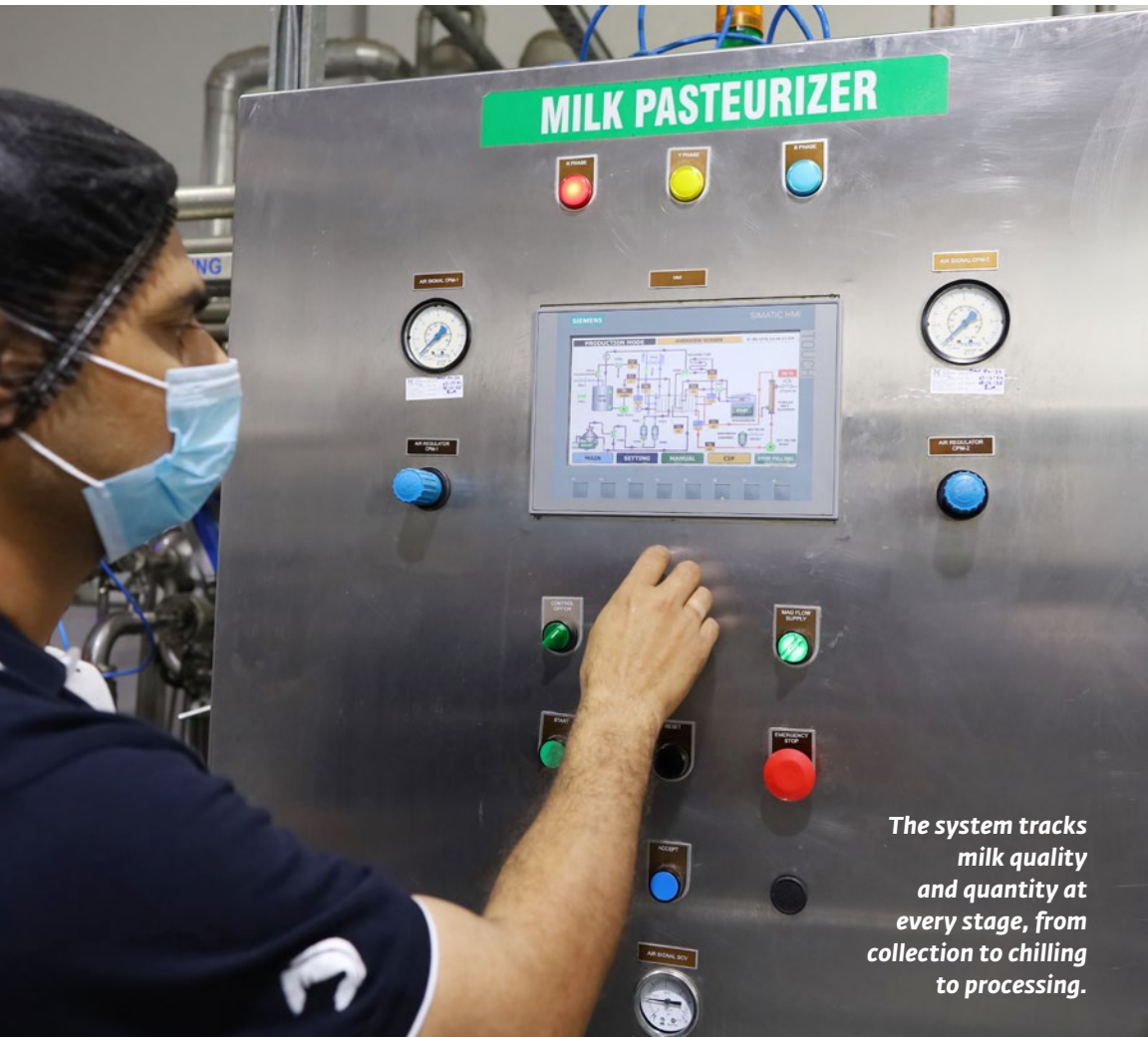
The system tracks milk quality and quantity at every stage, from collection to chilling to processing.

Stellapps, which was founded in 2011, is working to make that happen. The company is supported by Omnivore and IAF as part of a broader IFC strategy to foster greater resilience in India's food market by diversifying markets and supply, while also strengthening the quality and