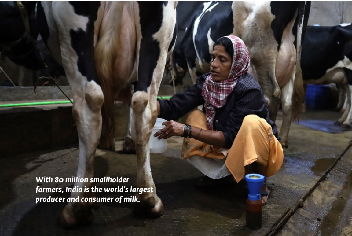
With 80 million smallholder farmers, India is the world's largest producer and consumer of milk.

Women are the backbone of agriculture in India, comprising