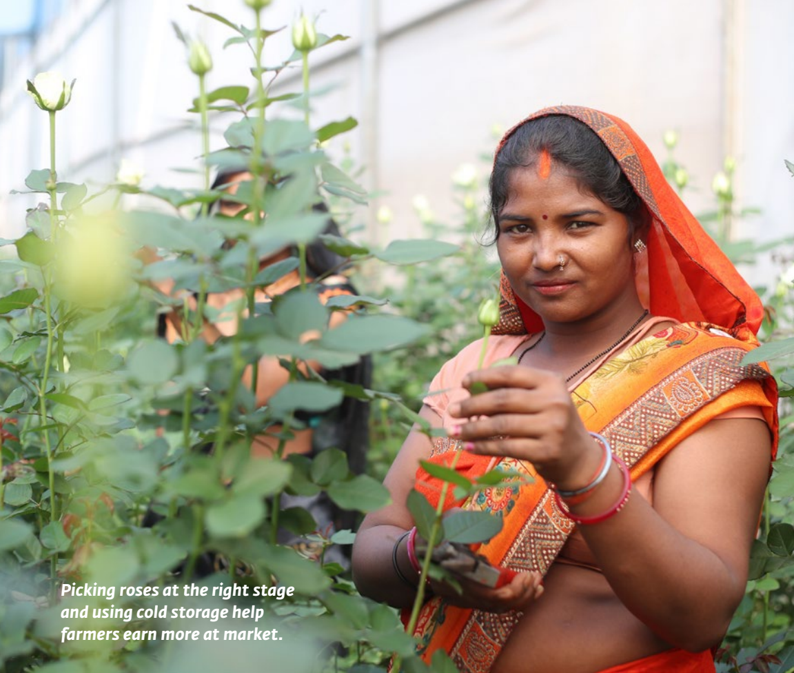
Picking roses at the right stage and using cold storage help farmers earn more at market.

grateful to Gates Foundation for its continued collaboration.