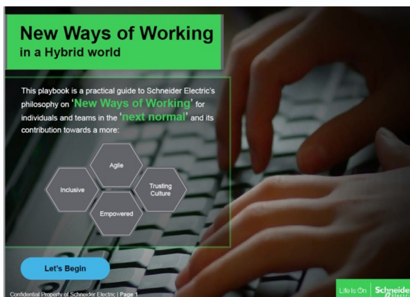
Figure 1: New Ways of Working in a Hybrid World

The policy and playbook are rooted in Schneider’s Diversity and Inclusion and Well-Being global commitments. The hybrid model recognizes the need for more flexibility, while also strongly valuing face-to-face connections to drive innovation. Country offices now follow the global policy, but they can be flexible, and can customize the policy’s implementation to address local needs.