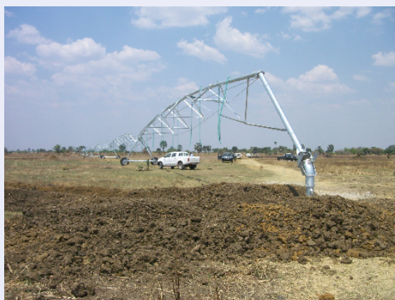
InfraCo Chanyanya Irrigation, Zambia

The model that was developed was based on a standard commercial company approach, with donors setting investment policy and country/sector limits and the company’s board of directors making the decisions on individual investments within these policy parameters. Company equity is held by a trust fund established by the PIDG specifically