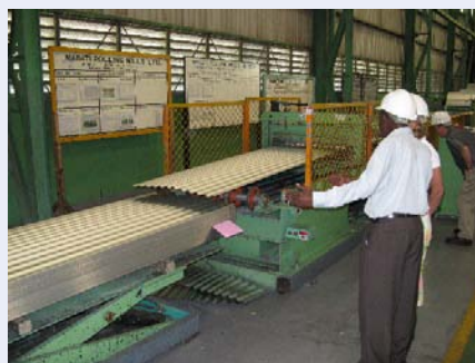
EAIF Safel Roofing Project, Kenya

Much friction and many delays would have been avoided if such a policy had been put in place from the outset.