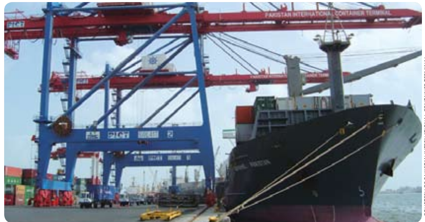
An $8 million IFC loan will help Pakistan International Container Terminal buy container-handling equipment and improve service at Karachi's port.

Afghanistan has long been known for the quality of its fresh and dried fruits. Despite decades of political unrest that undermined investment, the country's raisin and pomegranate crops still have significant export potential. IFC is helping producers and traders improve outdated production and processing technologies, build their supply chains, and expand their knowledge of export markets. This effort should enhance product quality and export earnings.