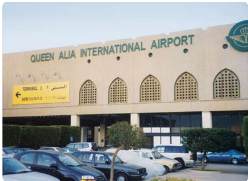
IFC is advising Jordan's government on the privatization of Queen Alia International Airport.

IFC's donor-funded facility, the Private Enterprise Partnership for the Middle East and North Africa, provides technical assistance to support the financial sector, small and medium enterprises, business environment reforms, and public-private partnerships for infrastructure projects. We are stepping up our corporate governance advisory work throughout the region, particularly in Egypt and Pakistan. In Egypt, we are also increasing the management capacity of small and medium enterprises through the Business Edge management training