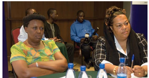
Women entrepreneurs learn about financial planning as part of dfcu's Women in Business program. Training provided by IFC.

of traditional loans. IFC-provided training covers banking requirements and processes, as well as financial literacy, business networking, and mentoring for businesswomen. dfcu employees have also received training on customer care and gender awareness.