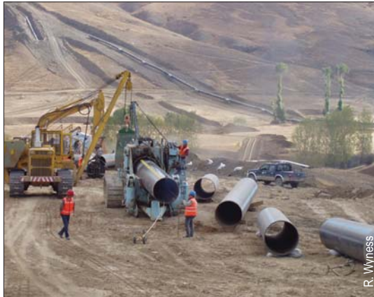
Pipeline construction operations.

IFC and the other lenders needed to be notified of any material changes to project implementation that would result in significant environmental or social impacts that might not have been sufficiently covered in the ESAs or catered for in the ESAP. A specific MoC mechanism was therefore included in the ESAP and used to notify lenders. While the inclusion of an MoC process was necessary, the criteria developed to determine when a "change notification" to the lenders should be triggered did not work particularly well in practice. The criteria were somewhat ambiguous and, as such, open to interpretation. They were also too narrowly focused on pipeline route changes and not other possible changes. The ambiguity led to disagreements between BTC, the lenders (including IFC) and the independent environmental consultant (commissioned to monitor compliance with the ESAP) as to what constituted a "significant" change and whether lender notification was warranted. In future, criteria need to be better defined to differentiate between what is considered a minor change and what is significant across all project related activities. From a lender's perspective, the MoC mechanism should be able to identify any changes in project implementation that would require an amendment to the provisions of the original ESAP and allow for the adjustment of ESAP procedures to effectively deal with environmental and social impacts on the ground.