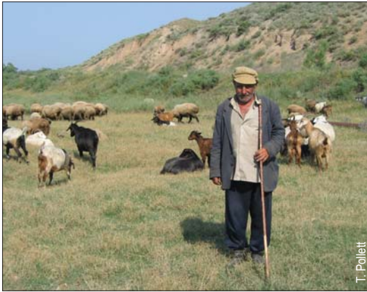
Herder affected by land acquisition in Azerbaijan.