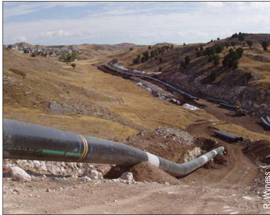
Pipeline construction passes near a hillside community in Turkey.

For IFC as a lender, the process of capturing lessons of experience from projects is an important one in which the objective is not to criticize or dwell on shortcomings but to learn. Analyzing events in retrospect and with hindsight is, of course, always easier than taking action and making difficult choices in real time. The sponsor deserves significant credit for its management of the environmental and social aspects of the project and our attempt to distill lessons from BTC for future projects should not in any way detract from this fact. In the pages that follow, IFC environmental and social staff look back on an extremely challenging process and endeavor to extract some of the key operational lessons and good practices for the benefit of colleagues, clients and the