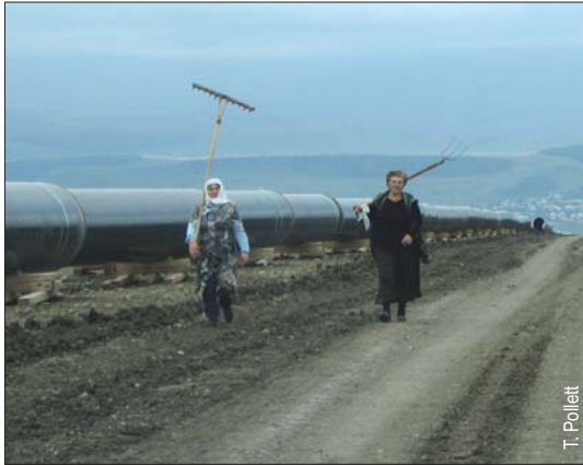
Georgian women returning from the fields.

IFC partnered with BP and others in late 2002 to implement a small and medium sized enterprise (SME) linkage program specifically related to the BTC project and other BP operated projects in the region. Operating from BP's Enterprise Centre, this program is part of IFC's ongoing strategy of working closely with its clients to provide developmental support through linkages to IFC's investment projects. The purpose of this SME linkage program is to direct support to