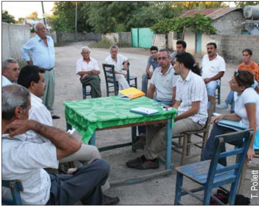
Consultation meeting with villagers in Turkey.