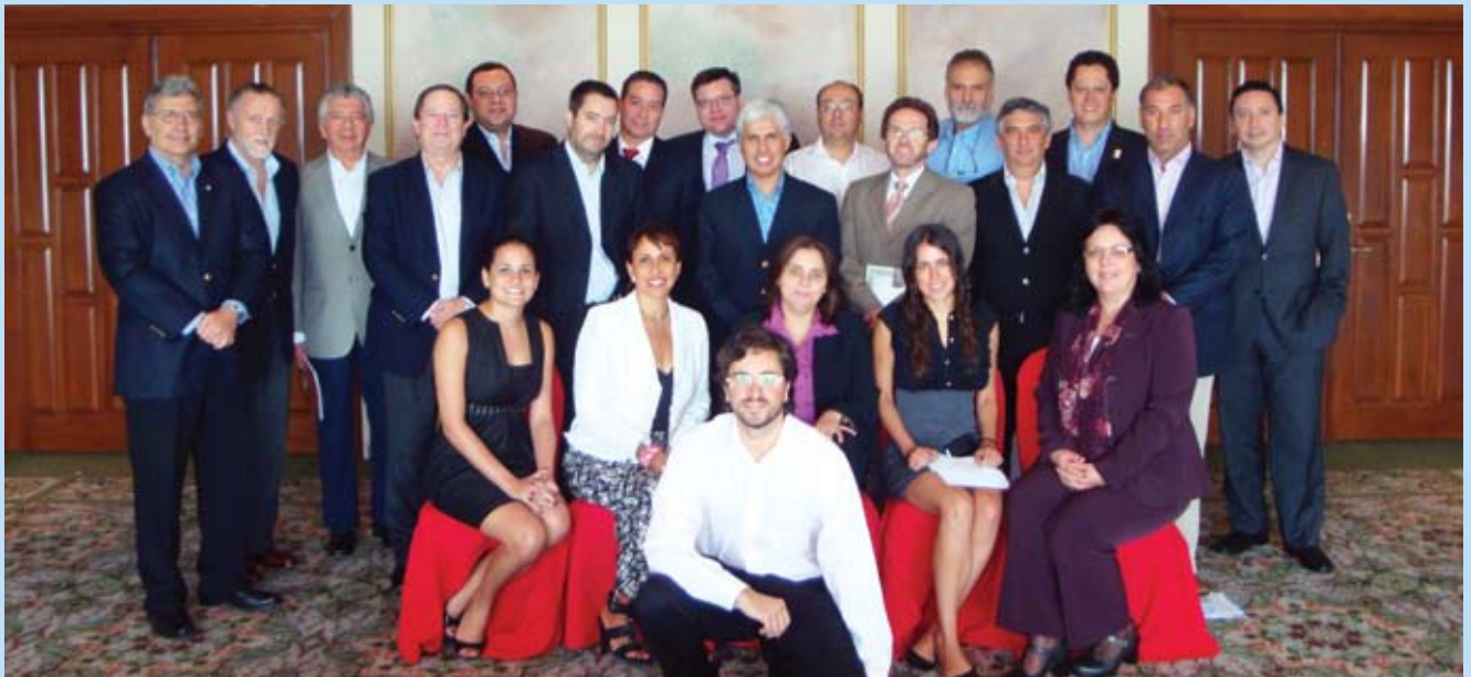
Scenes from the Forum's initiatives to expand training of board directors in Panama (top and bottom photos) and Sao Paulo (middle photos).