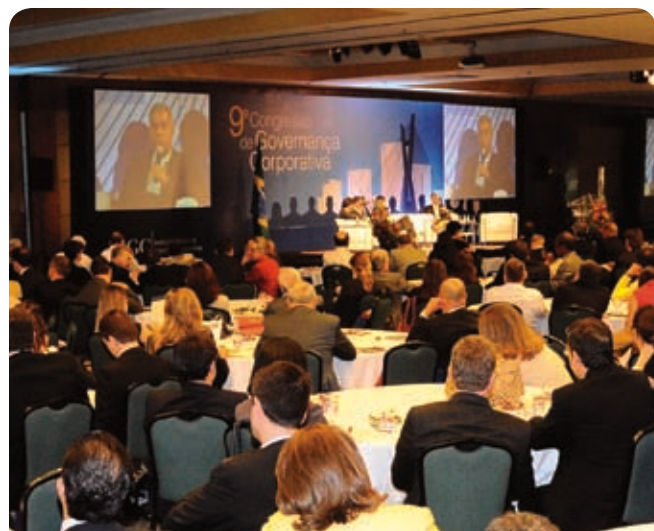
IBGC Ninth Annual Congress

It is generally agreed that the IBGC should be more pro-active with in-company courses, but some