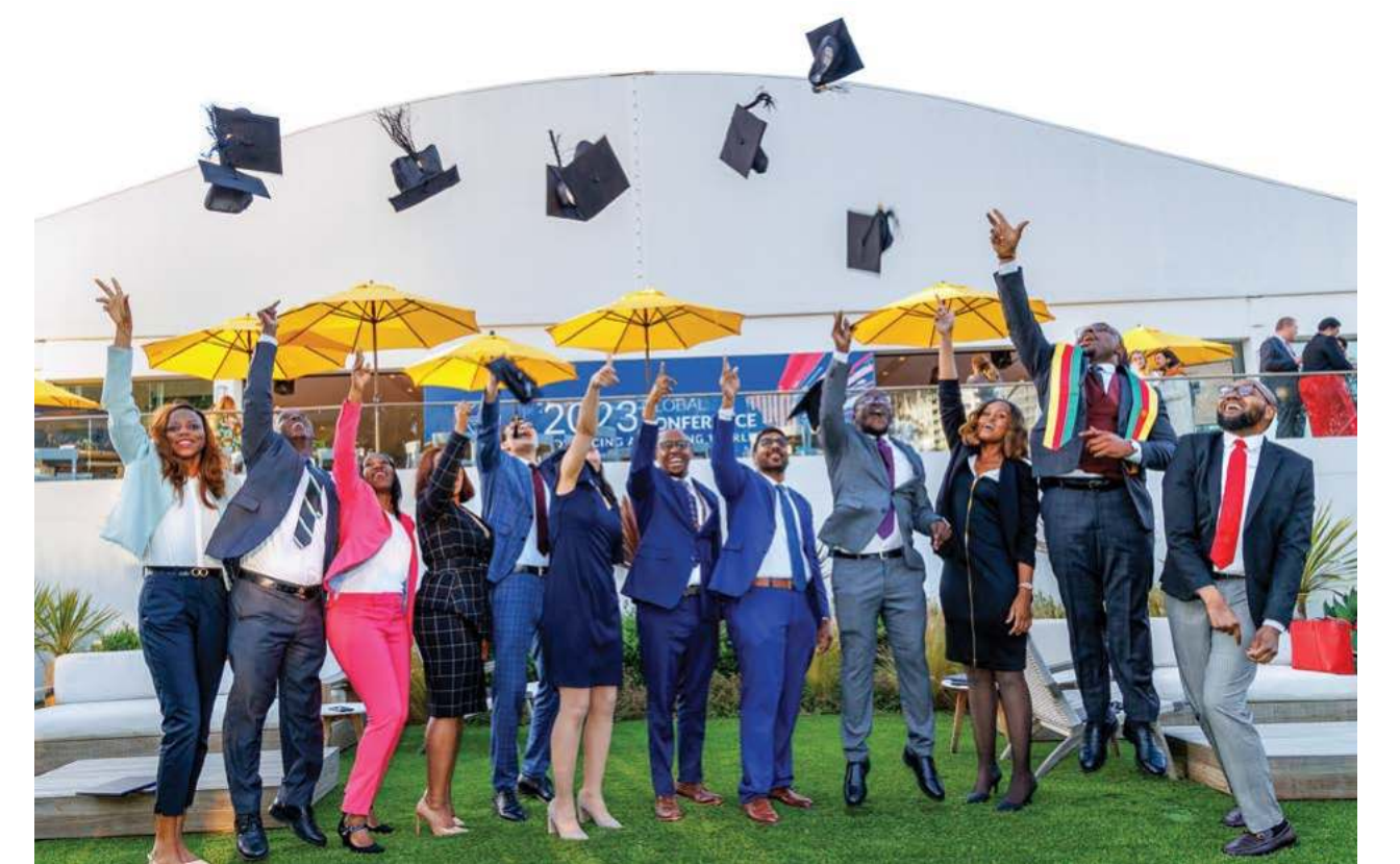
Photo: May 2023 graduation ceremony for the ninth cohort of the IFC-sponsored Capital Markets program.

The students spend about eight months in Washington, D.C., or in Paris, first completing a certificate program at the George Washington University or an executive master's at Paris Dauphine, with courses on financial markets fundamentals, corporate governance, regulatory regimes, and other topics. Then they intern at investment banks, asset management firms, or international organizations like the World Bank Group.