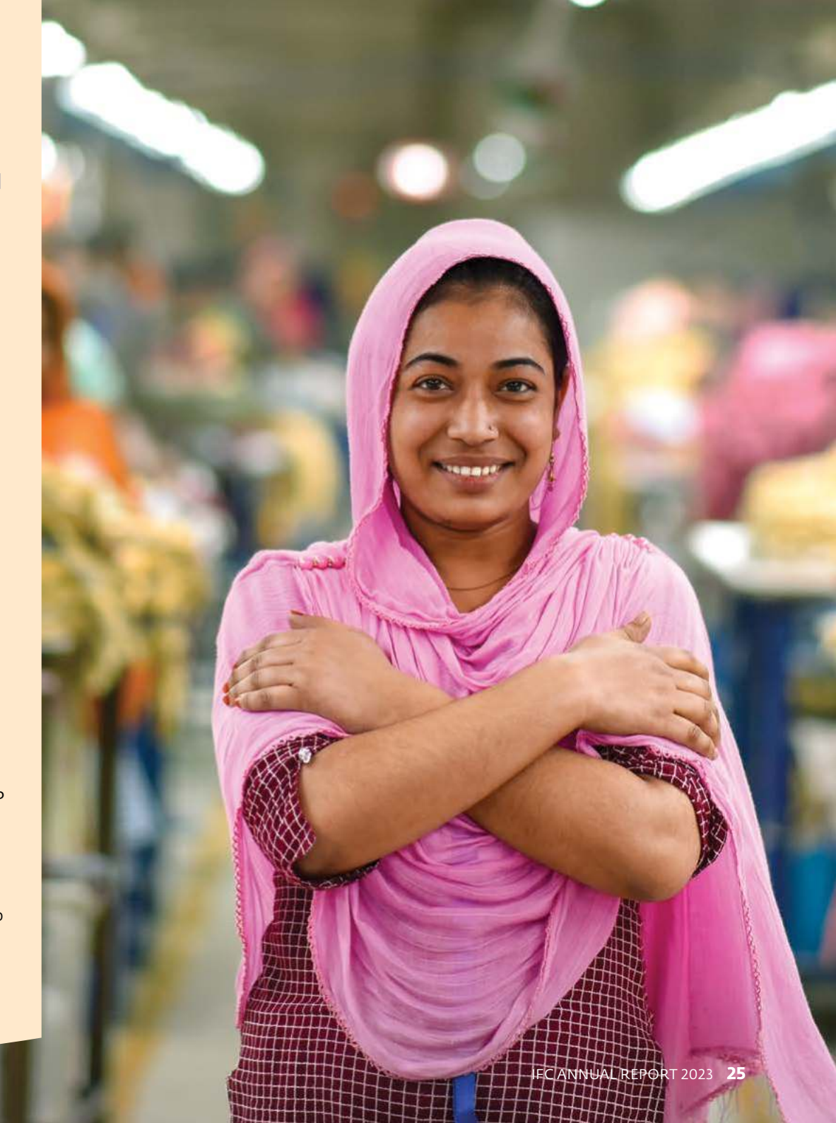
Photo: Bangladesh's garment sector employs more than 3 million women. A partnership between IFC and Levi Strauss & Co. helps factories identify and implement cleaner and more resource-efficient production options.

In this way, trade finance is central to turning the wheels of global commerce. By innovating to expand trade finance through partnerships like ours with BNP Paribas, IFC is supporting prosperity worldwide. Our guarantee agreement frees up capital to facilitate trade flows, keeping the engine of emerging economies running through uncertain terrain.