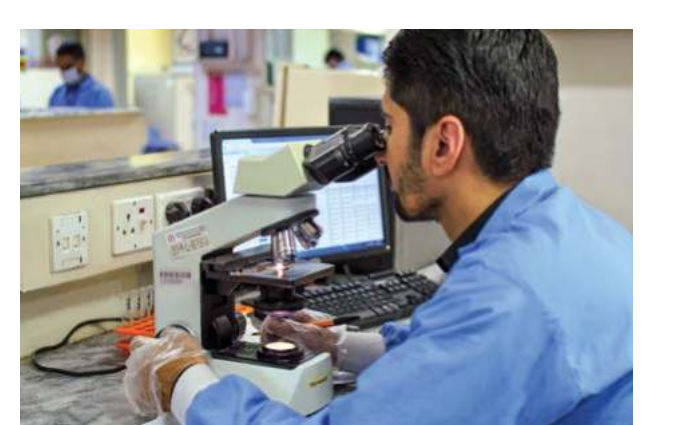
Photo: Northwest General Hospital and Research Center in Peshawar. Pakistan.

Our global focus on addressing the impacts of climate change is also evident in Pakistan, a country that is responsible for only 0.3 percent of global emissions but is disproportionately affected by extreme weather events such as floods and cyclones. We are looking to scale up support for sustainable and climate-resilient infrastructure while also supporting micro, small, and medium enterprises and strengthening capital markets. In addition to financial support, IFC provides advice on partnerships between the government and private sector to improve the country's water supply, hospitals, and airports. Through this support, a firstof-its-kind framework has been developed for airport outsourcing in the country.