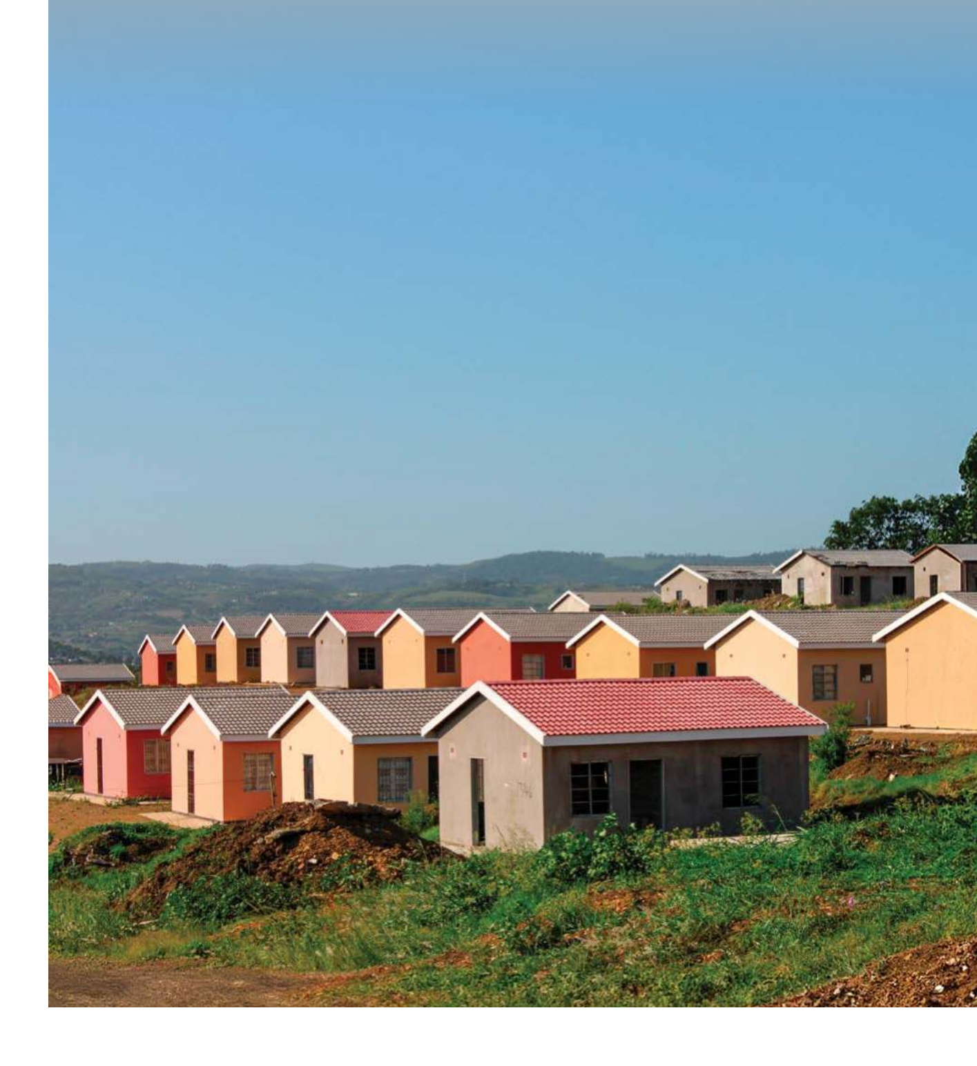
Photo: New affordable urban housing under construction in the Mandeni Municipality of South Africa's iLembe District of KwaZulu-Natal.

IFC has signed an advisory agreement with the government to address this shortage through structuring and implementing a public-private partnership that will help provide a variety of single-unit family dwellings and affordable flats. IFC will assist the government in running an open and competitive bidding process to identify a highly experienced private developer to design, finance, build, and maintain the housing for a defined period. This affordable housing project will not only help address a housing shortage and problems associated with informal settlements, but will also provide a stock of climate-resilient homes that incorporate green design specifications.